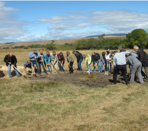
Ground breaking ceremony with neighbors, owners, subscribers, lenders and politicians in attendance

Subscriptions are a great way to get green power. They create savings, not an extra expense like utility green power, and they cost a lot less than solar PV or a small wind system at your building.